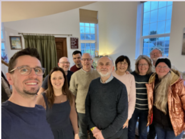
An Alpha Away Day