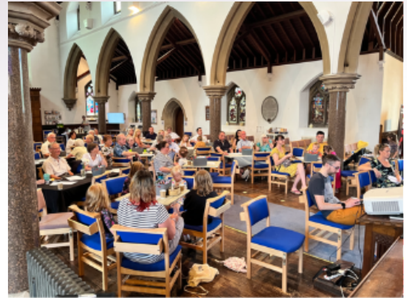
Café Church on a 4 th Sunday