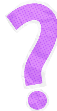
Youth Worker p/t (Vacancy)