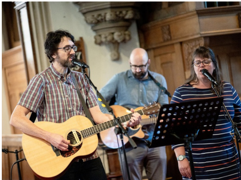
The band at our 11am gathering

There are currently 93 people on our electoral roll.