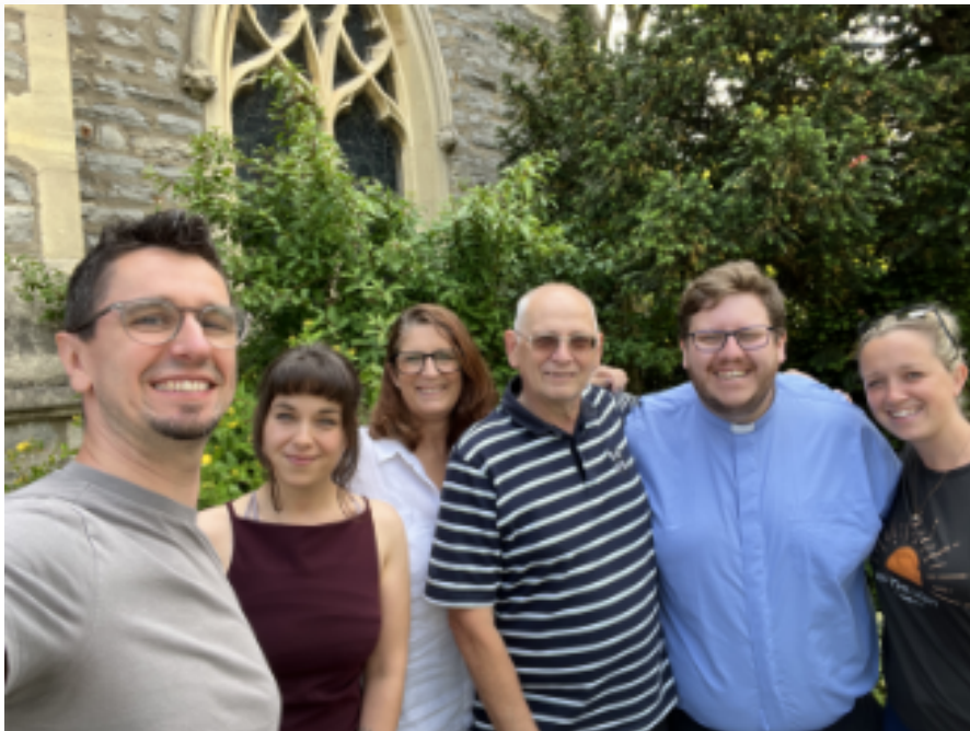
Wider Staff Team Including Churchwardens