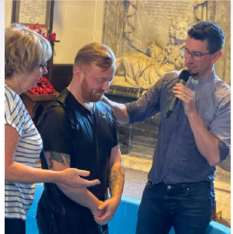
A recent baptism