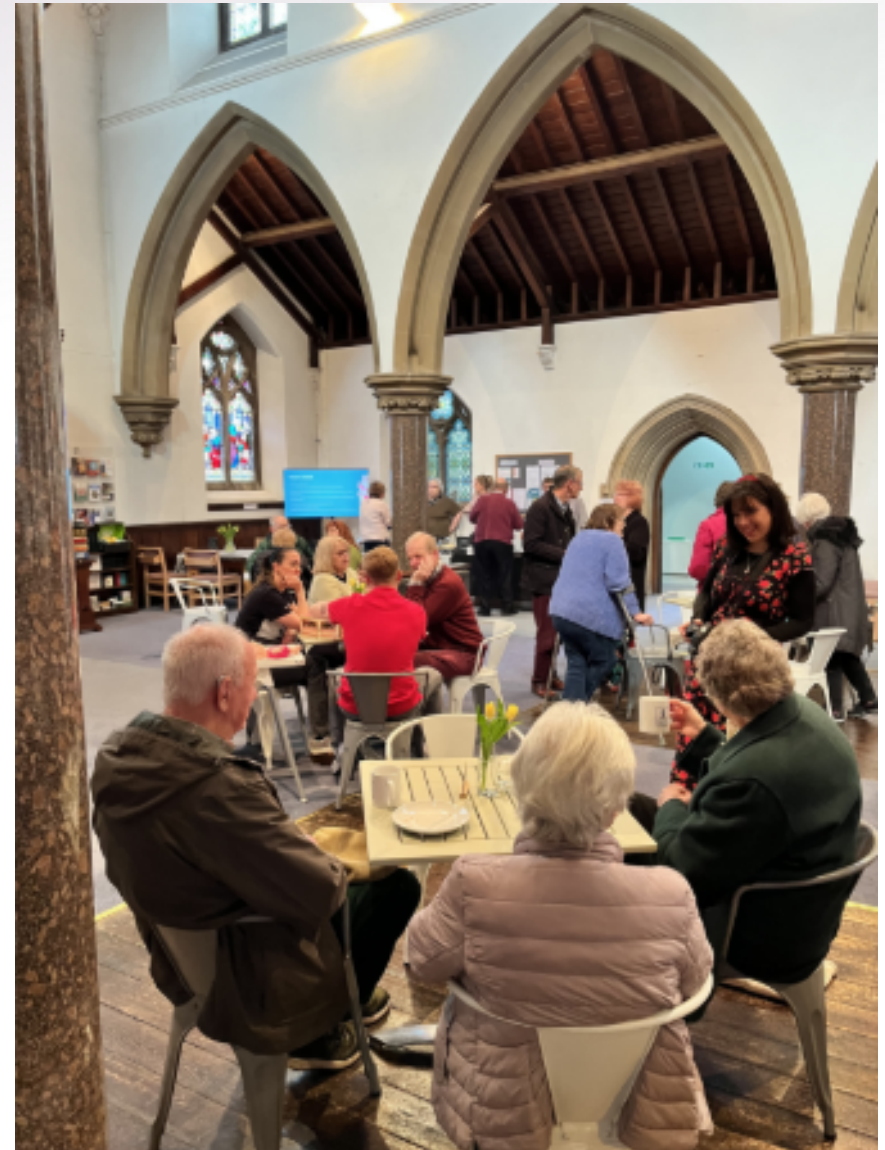
'The Point' Community Cafe

In addition to the above, we're one of three churches involved in running the YouNite ecumenical youth project which runs in the town every Friday night during term time, a care home ministry, the ARK fund project (ARK stands for 'Acts of Radical Kindness') which has been set up simply to love and bless our neighbours. There are also various other creative ways we're developing connections with our community.